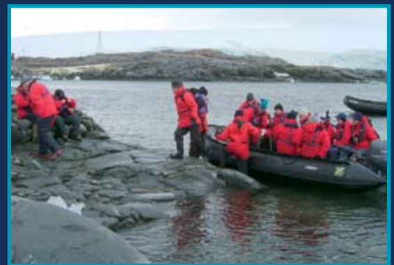
Primary landing area