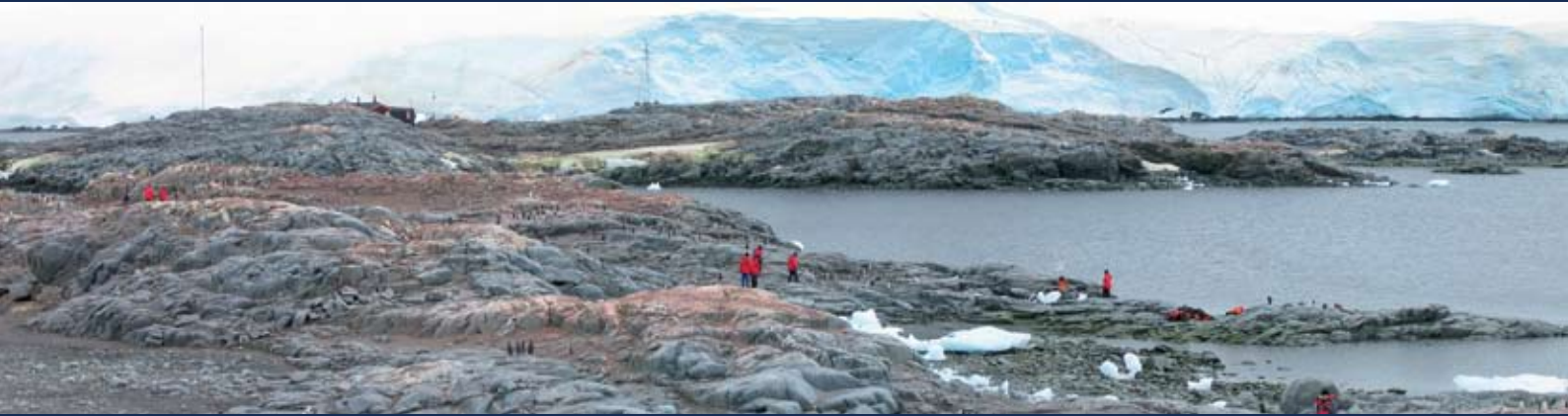
Jougla Point with Goudier Island in the background